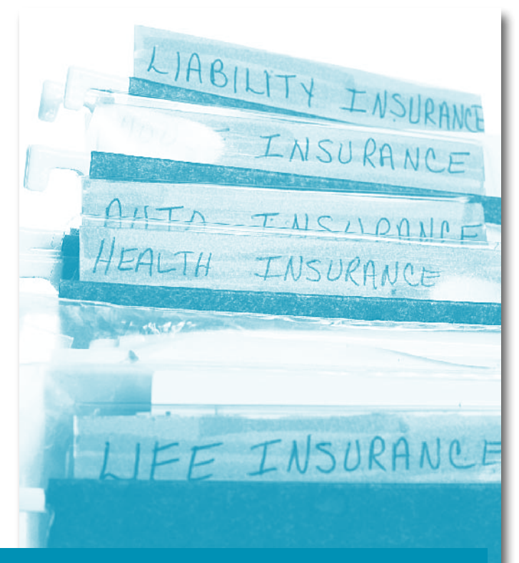
The Insurance Information Institute offers a wealth of information on all types of insurance at <a href="https://www.iii.org">www.iii.org</a>. See page 167 for additional contact information.

Homeowners who live in areas prone to flooding should take advantage of the National Flood Insurance Program (p. 114).