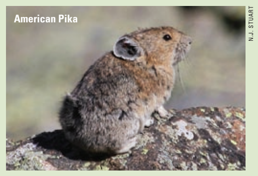
Some species, such as the American Pika, are already surviving at the limits of their ecological tolerance.

By connecting people with nature today we are promoting healthy lifestyles and improving the chances that future generations will have an affinity for nature and a concern for its conservation. Learn more at < www.fws.gov/letsgooutside >.