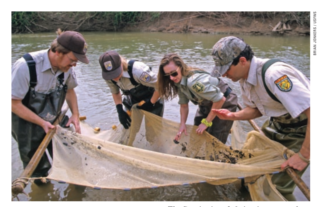
The Service is redefining its approach to partnerships by promoting relationships that allow a region's private, state and federal conservation infrastructure to operate as a system rather than as independent entities.

Habitat management agencies (e.g., Forest Service, Bureau of Land Management, Natural Resources Conservation Service, Farm Service Administration, Department of Defense, Bureau of Reclamation and Bureau of Indian Affairs) will be responsible within the context of their specific missions for treating these designs as an important guide for management decisions and commitment of resources. This calls for a new operational construct for agency collaboration through the collective integration of common goals for wildlife conservation, and the directed efforts of the respective agencies to achieve these goals. >> continued on page 10