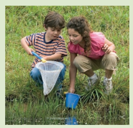
Connecting people with nature also helps connect them to the Service's conservation mission.