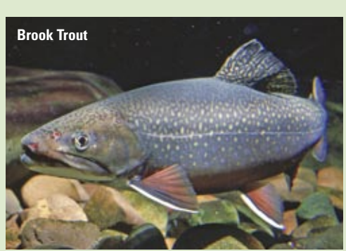
Water management is crucial for sustainable habitats that support plants and animals.

As climate change expands the scale and complexity of the challenges facing candidate and listed species, landscape conservation offers the conservation community a way to identify, prioritize and improve recovery efforts while remaining responsive to changing threats and new scientific information.