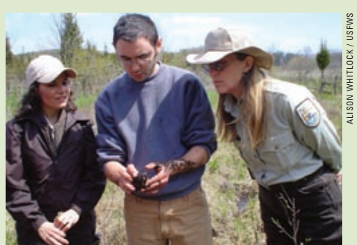
Partnerships are critical to the landscape conservation process.

Because sea level rise is a projected impact of climate change, the Service is currently examining related affects on our 166 coastal national wildlife refuges. Using predictive models, refuge managers will be able to understand what will happen as the ocean level rises, how fresh water marshes will give way to salt water, and then slip below the ocean's surface. Knowing this information in advance will help refuge managers make long-term planning decisions and implement strategic actions to help fish and wildlife species adapt.