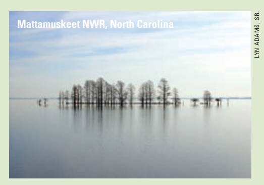
Refuges are living case studies for resource management challenges.