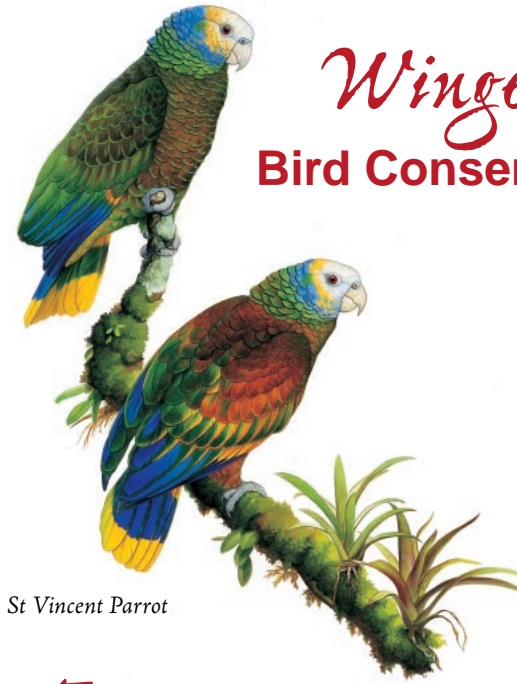
St Vincent Parrot

From large, gaudy parrots to small, migratory warblers, the birds of the Caribbean represent a wide diversity of species. Many of the islands have a special endemic avifauna found nowhere else in the world. Hundreds of migratory birds are dependent upon the islands either as a stopover site for resting and refueling, or as a place to spend the nonbreeding season. These species are a source of pride to the Caribbean people who treasure their uniqueness and value their role as consumers of agricultural insect pests and seed dispersers. As a key tourist attraction, they also provide an important boost to the local economy.