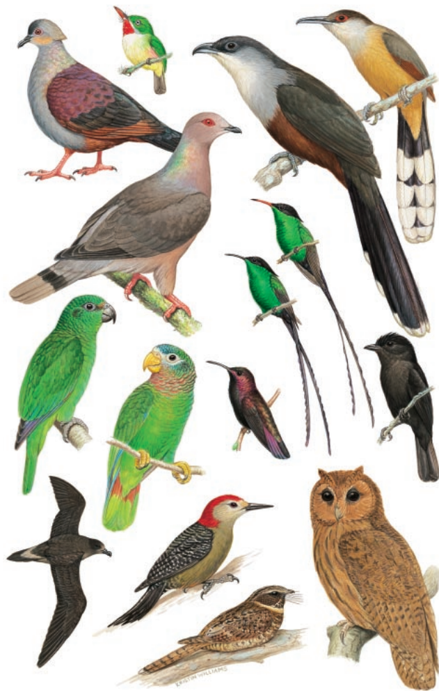
Some of Jamaica's many endemics include (from left to right, top to bottom): Crested Quail-Dove; Jamaican Tody; Chestnut-bellied Cuckoo; Jamaican Lizard-Cuckoo; Ring-tailed Pigeon; Red-billed Streamertail; Black-billed Streamertail; Black-billed Parrot; Yellow-billed Parrot; Jamaican Mango; Jamaican Becard; Jamaican Petrel; Jamaican Woodpecker; Jamaican Owl; Jamaican Poorwill

Jamaica has more endemic bird species than any other island in the Caribbean. And from September to May, almost two-fifths of the song birds in Jamaica are migrants from North America. This rich birdlife is threatened by the country's extremely high deforestation rate of 5.3% per year, which is one of the highest in the world. At least three endemic bird species are considered extinct and many are endangered. Conservation efforts are hampered by the general population's lack of environmental awareness and knowledge of Jamaica's natural heritage.