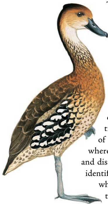
West Indian Whistling-Duck

Winged Ambassadors collaborates with conservation organizations on most of the Caribbean islands. Some endeavors have a regional focus and involve many partnerships. The "West Indian Whistling-Duck and Wetland Conservation Project" connects groups from Antigua, Barbuda, Bahamas, Cayman Islands, Dominican Republic, Jamaica, and the Turks & Caicos in an effort to protect this endangered duck.