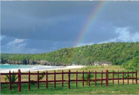
Playa Caracas Refuge east side

ecological value, the refuge contains important archeological and historic resources, including artifacts of the aboriginal Taino culture and the island’s sugar cane plantation era.