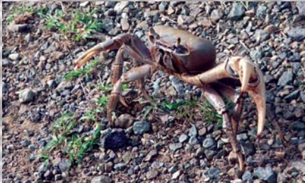
Common Land Crab

Various species of crustaceans are known to occur in the coastal waters and in near shore marine