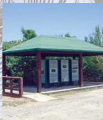
Kiani Lagoon kiosk and boardwalk