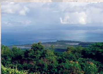
Vieques NWR west view