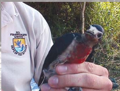
Bird banding project