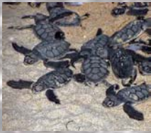
Green sea turtle

All other mammals were introduced by man to the island and include the house mouse, black rat, small Indian mongoose and domestic animals such as cattle, horses, dogs and cats.