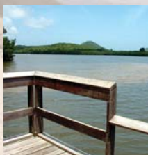
Fishing pier at Kiani Lagoon