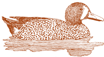
Blue winged teal