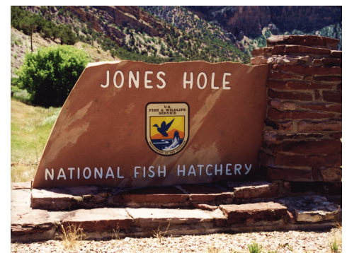
Welcome to Jones Hole National Fish Hatchery

Open to the public, Jones Hole NFH welcomes visitors to the hatchery for a closeup view of the fish production process. With over 7,000 visitors annually, the dedicated staff are happy to answer any questions while you explore the hatchery grounds and view the fish. Educational programs and hatchery tours are provided to school groups and visitors when scheduled in advance.