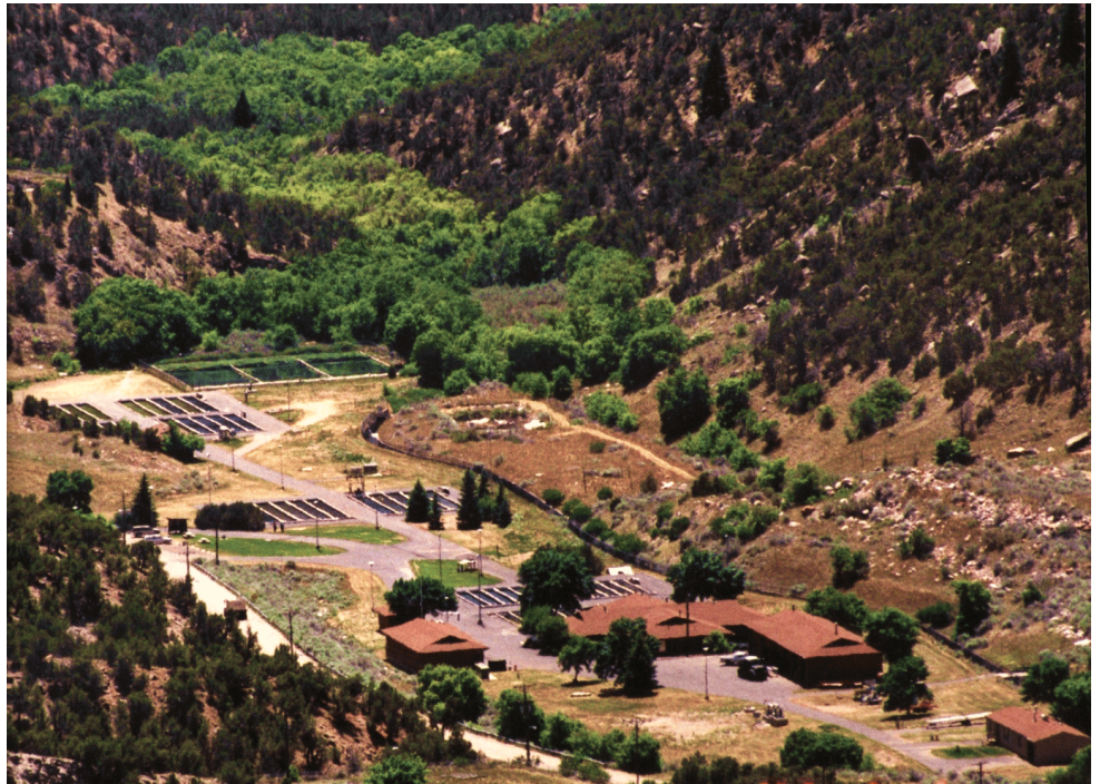
Overview of Jones Hole National Fish Hatchery

Dust off those boots as you hike to Dinosaur National Monument in the spectacular surroundings, or try your luck landing 'the big one' in Jones Hole Creek. Be sure to bring your binoculars and test your wildlife knowledge while hiking or fishing. You just may be carried away with all the waterfowl and riparian birds!