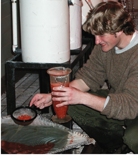
Hatchery employee straining trout eggs