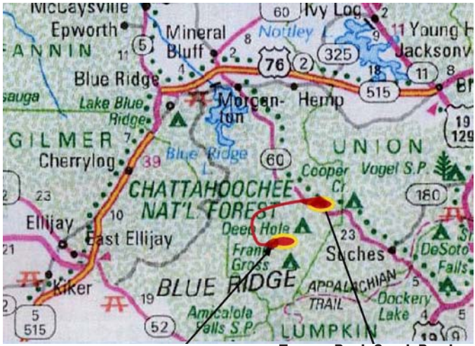
Chattahoochee Forest National Fish Hatchery