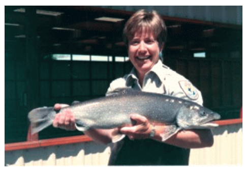
Hatchery employee holding a broodstock lake trout