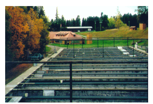
Creston National Fish Hatchery raceways

Creston NFH helps in many ways. Currently, the hatchery produces trout and trout eggs to fill Tribal, State, and research needs across Montana. These fish help to replenish and encourage sustainable trout populations and provide angling opportunities for recreational users like you.