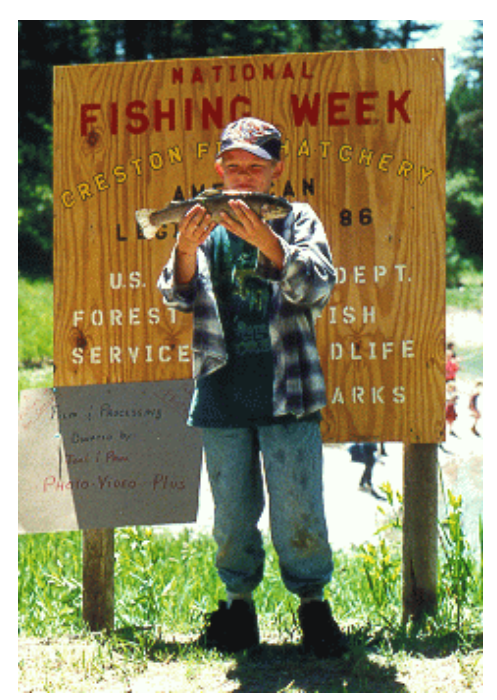
Successful day at the Creston NFH National Fishing Week fishing derby

As the aquatic habitat changes due to natural (drought, flood, habitat destruction) or human (over-harvest, pollution, habitat loss due to development and dam construction) influences, the reproduction of fish in the wild declines. Stocking of fish is one of the many management strategies used by biologists to help replenish the populations for years to com e.