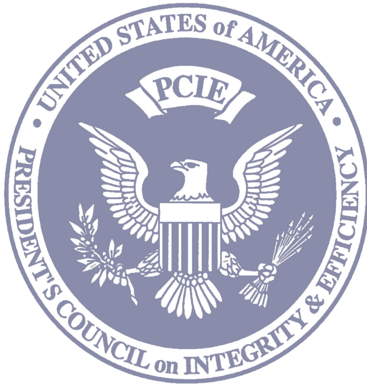
President's Council on Integrity and Efficiency

Promoting economy, efficiency, effectiveness, and integrity throughout the federal government.