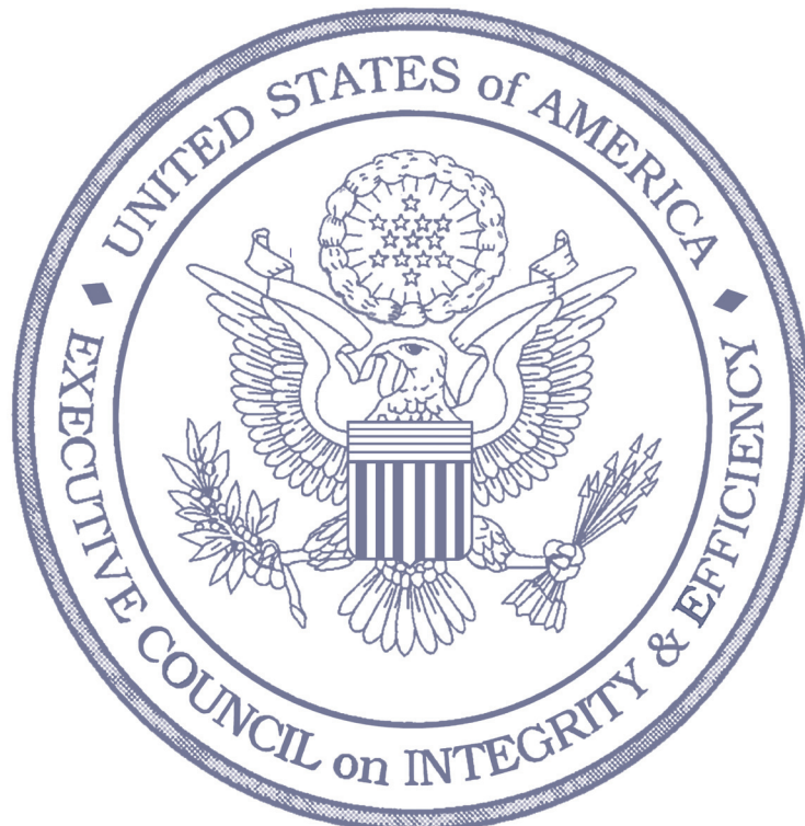
Executive Council on Integrity and Efficiency