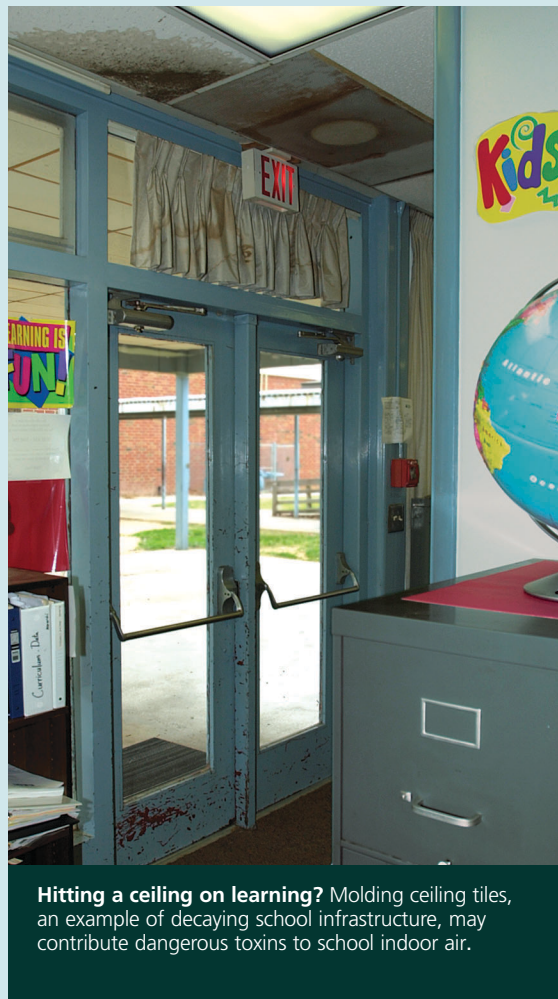
Hitting a ceiling on learning? Molding ceiling tiles, an example of decaying school infrastructure, may contribute dangerous toxins to school indoor air.

Poor indoor air quality affects student performance of mental tasks involving concentration, calculations, and memory, and thus academic achievement, studies reveal. For example, the EPA Indoor Air Quality (IAQ) and Student Performance Web site summarizes a 1996 European study of 800 students from eight different schools, published in Indoor Air '96. The Seventh International Conference on Indoor Air Quality and Climate . In the study, carbon