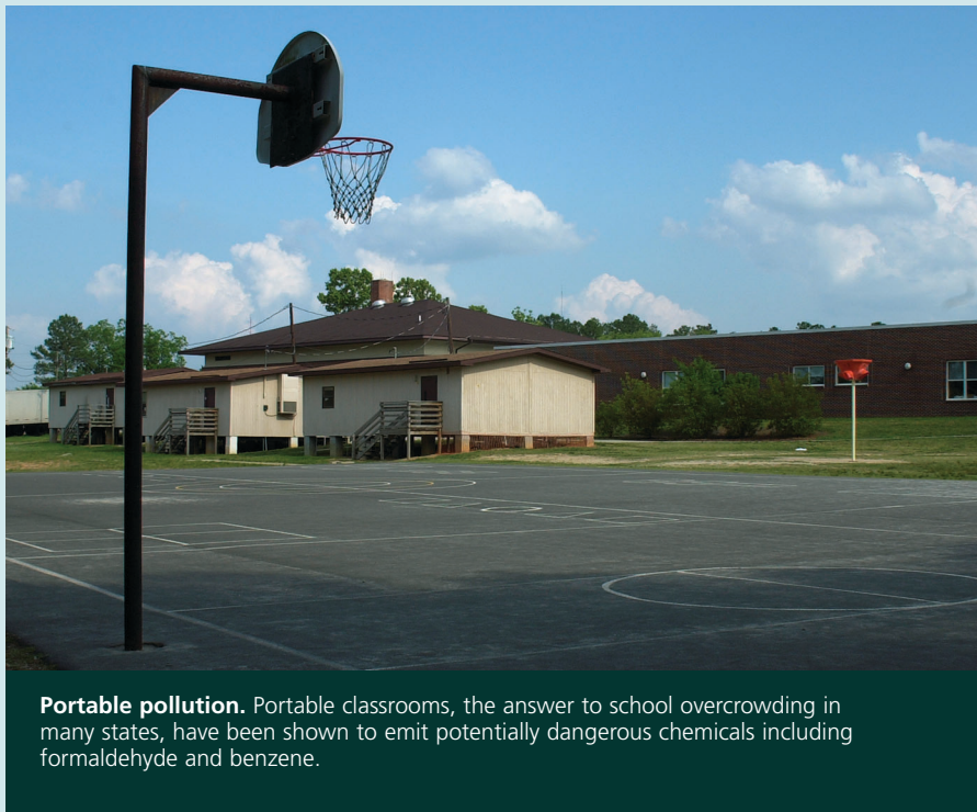
Portable pollution. Portable classrooms, the answer to school overcrowding in many states, have been shown to emit potentially dangerous chemicals including formaldehyde and benzene.