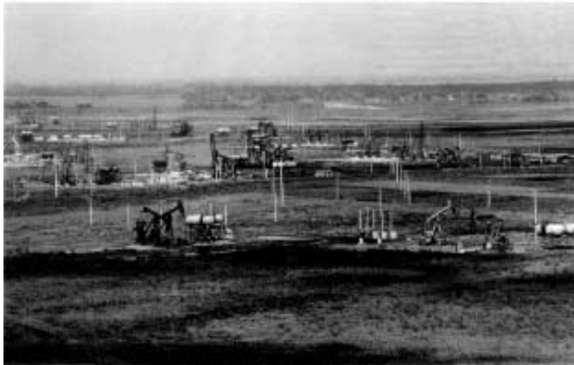
Lingde Oilfield Development Corporation of Liaobei Oilfield has been exploring reserves of 4424 and super heavy oil depending on the progress of oil. It rich, and has realized a production capacity with annual output of million tons of crude oil throughout three years.