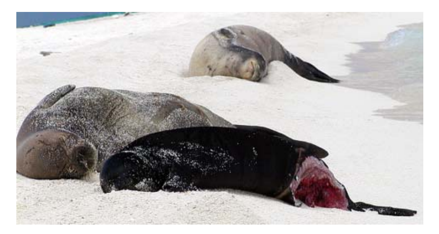
Figure 23. Hawaiian monk seal pups on Trig Island, French Frigate Shoals, have experienced high rates of shark predation. The pup in the foreground had its left hind flipper completely removed by a shark attack and died shortly after the picture was taken.

Based on cleanup results and plans described at the Commission's April 2002 program review, the panel was impressed by the extent of work done to date. It recommended that the reef clean-ups and accumulation studies be continued and that monk seal field teams continue to disentangle seals and remove hazardous debris from atoll beaches. The panel also recommended that greater effort be focused on identifying the origins of the derelict netting and line so that education programs and other mitigation measures can be developed to