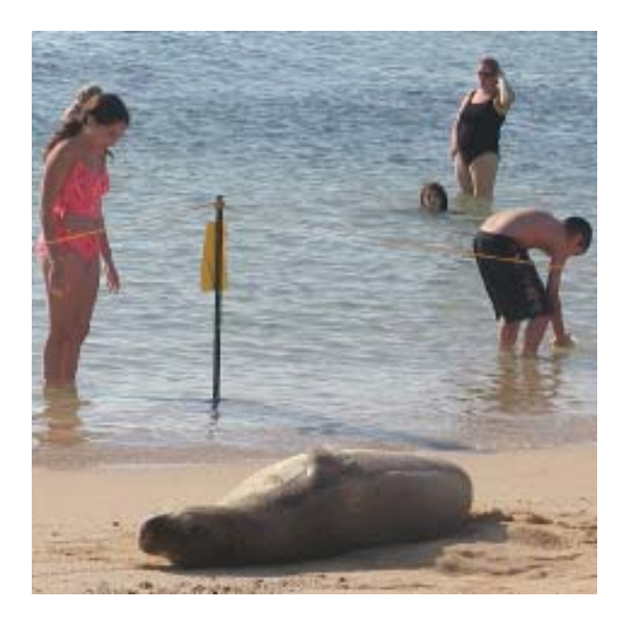
Figure 24. Hawaiian monk seals recently have begun hauling out at popular swimming beaches on the island of Kauai. Volunteers post signs with yellow tape to keep people at a respectful distance.

In the fall of 2002 it became apparent that limited progress had been made on drafting a plan since the team's March meeting and that it was unlikely that an additional team meeting would be held before December. Therefore, upon learning of the situation, the Commission after consulting with the National Marine Fisheries Service, contracted with an individual to work with the recovery team to help assemble and complete a draft plan.