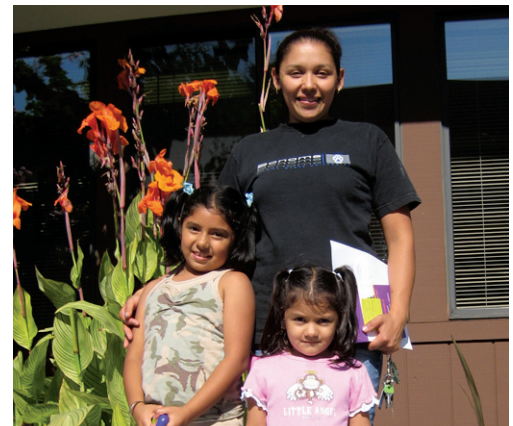
The Institute is developing two new titles to support Hispanic families with children in grades K-3.