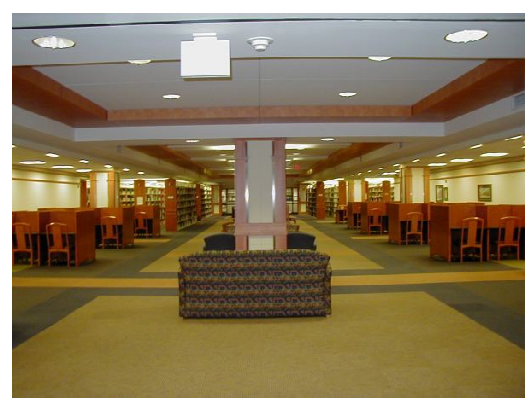
Todd Wehr Library

For more information on MCW Libraries, please visit our web site at <a href="http://www.lib.mcw.edu">http://www.lib.mcw.edu</a> or e-mail us at <a href="mailto:asklib@mcw.edu">asklib@mcw.edu</a>.