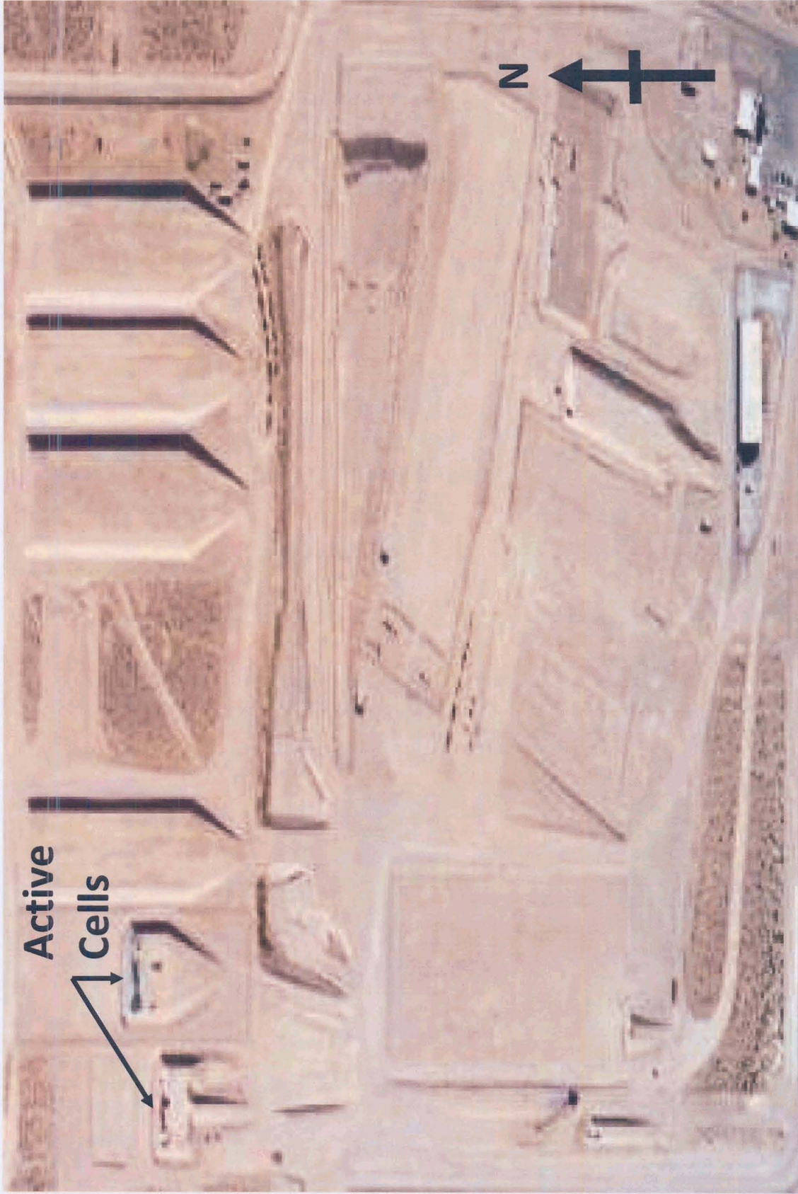
Fig. 1. Aerial view of Area 5 showing open and closed disposal trenches (see Fig. 2 for layout details).