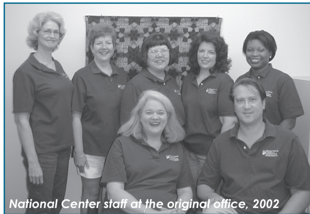
National Center staff at the original office, 2002