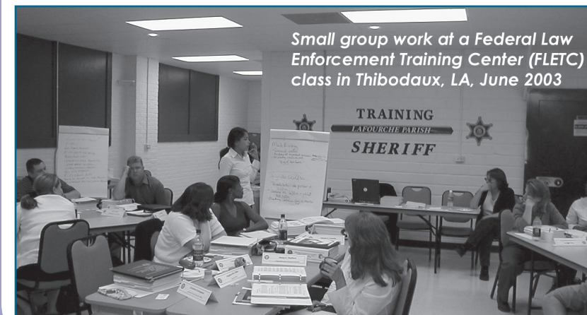
Small group work at a Federal Law Enforcement Training Center (FLETC) class in Thibodaux, LA, June 2003

2001 was also a challenging year for the National Center. In August, our dear friend and founding