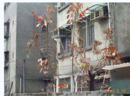
Figure 3. Serial photos showed yellowish discoloration of plants (arrows) exposed to gas leakage. Some plants ( Dimocarpus logan shown here) withered and died.