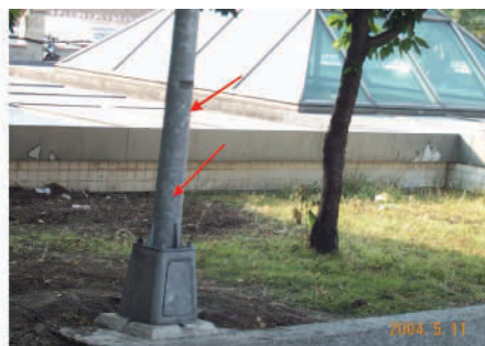
Figure 2. Whitish or corroded spots (arrows) were present on the metal surfaces of street lamp poles in the exposed region.