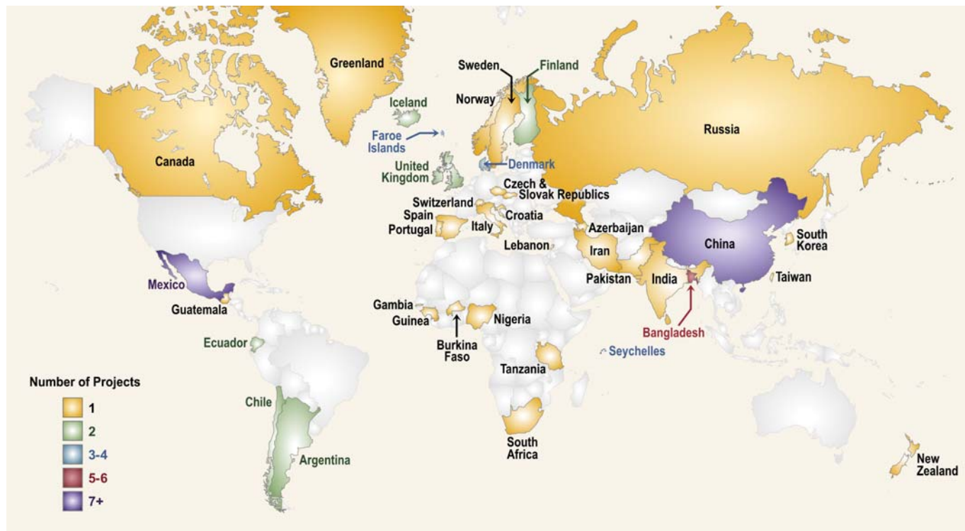
Figure 1. The NIEHS extramural GEH portfolio during FYs 2005–2007. The portfolio includes 57 projects in 37 countries across the globe. Greenland and Faroe Islands are shown as separate entities, but they are officially Danish territories and thus are not counted as separate countries.

a Nearly half the world cooks with solid fuels.