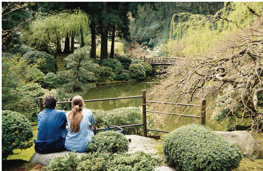
Building and bonding. Understanding the stress-fighting effects of certain elements of the built environment may shed light on how people’s surroundings affect their quality of life.

The environmental features surveyed mapped closely onto four domains of topophilia: ecodiversity (the presence of flowers, water, and other elements of nature), synesthetic tendency (a