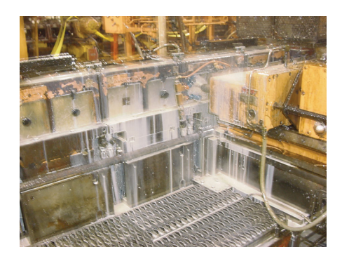
Figure 1. In a process similar to that used by the patient, metalworking fluid (milky appearance) is flowed over auto parts to reduce friction and cool metal tools. As fluids are sprayed over metal parts, a visible aerosol is formed that can be breathed by operators of the machinery unless specific control measures are instituted. Fluids are recycled from large holding tanks. The presence of carbon and water in fluids permits growth of microorganisms, including mycobacteria.

With the assistance of the county health department, samples of metalworking fluid were obtained for culture from the large reservoir supplying metalworking fluids to the patient's work area. Standard bacterial and fungal counts were below the level of detection of 10 organisms/mL, unusually low for industrial metalworking fluids, which are usually contaminated by microorganisms. Stain of the centrifuged fluid pellet for acid-fast bacilli was qualitatively "very high," and culture grew 1.6 \times 10^5 mycobacteria/mL, which were identified as M. chelonae. This mycobacterium, although similar to the M. chelonae-abscessus group, has been proposed as a new species, Mycobacterium immunogenum (Brown-Elliott and Wallace 2002). Additional, separate fluid