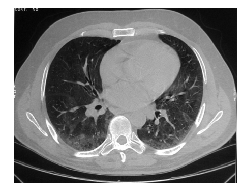
Figure 3. Thin-section CT scan of the chest showing ground glass opacities in the lung parenchyma, indicating interstitial inflammation and/or fibrosis.

routine microbiologic testing of industrial metalworking fluids, such that their identification requires knowledge of their potential for growth and the ability to perform special testing.