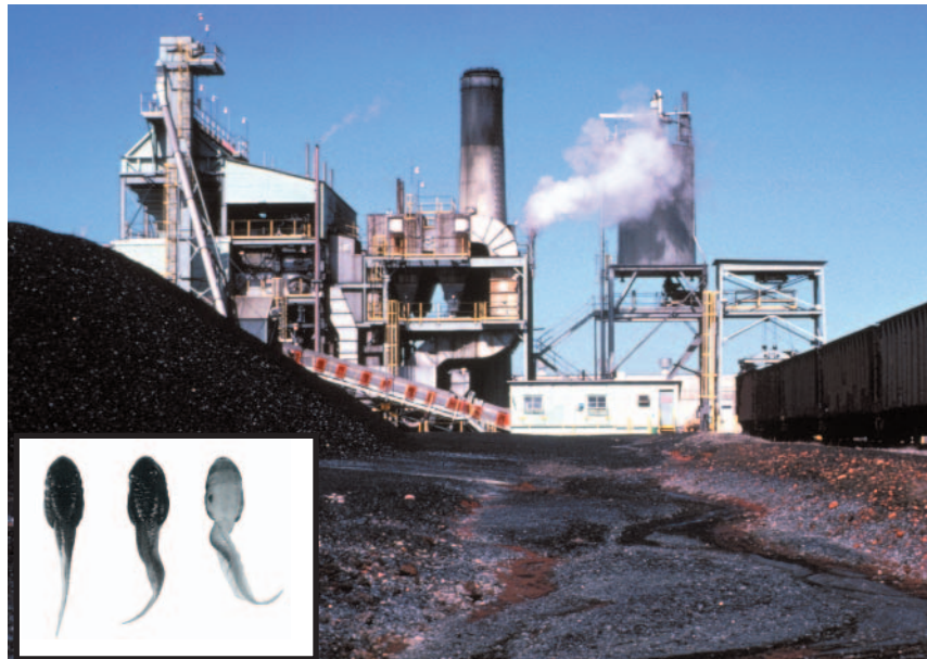
The wages of waste. Coal combustion products are often placed in settling basins such as these, located at D Area of the Savannah River Site in South Carolina, and effluent can then drain into local waterways. Malformities have been seen in animals living in nearby wetlands, such as these South Carolina tadpoles (inset, center and right, compared with normal tadpole, left).

in Wisconsin has polluted groundwater, says Mike Zillmer, a Wisconsin Department of Natural Resources hydrogeologist, and has contaminated eight private wells with boron, sulfates, and molybdenum. The company, which placed ash in water in a former gravel pit, is paying to supply bottled water to four houses, and four other wells have been abandoned. The contaminated plume is still spreading, though; authorities continue to monitor the groundwater and will require the replacement of drinking water supplies if additional wells are affected.