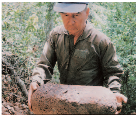
Political bombshell? A worker removes unexploded ordnance from the Piña firing range.

After months of talks, on 19 September 2000, the Panamanian government, represented by ambassador Ramón Morales Quijano, brought its case before the United Nations, asking for the international agency’s assistance in resolving the matter. What was once a “quiet” controversy may now become an international issue. —Ron Chepesiuk