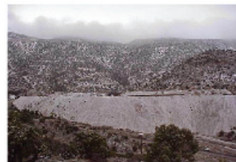
Excavated rock and debris removed from a tunnel DTRA used for nuclear testing on the northern portion of the Nevada Test Site.

If DTRA's environmental management activities sound similar to Industrial Sites clean up activities, it is because DTRA's sites are categorized as Industrial Sites. So what's the difference? The difference is the owner of the potentially contaminated area. While DTRA tackles contamination resulting from its U.S. Department of Defense predecessor agencies, the rest of the Industrial Sites project addresses contamination resulting from U.S. Department of Energy activities.