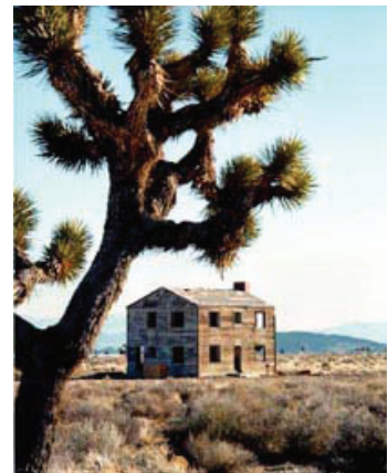
Apple II House

For a complete listing of tour dates, go to: http://www.nv.doe.gov/nts/tours.htm . Tour participants will visit historic nuclear test locations, such as Sedan Crater, as well as observe areas where work activities are currently taking place, like the Radioactive Waste Management Complex. The tour covers approximately 250 miles. Call (702) 295-0944 for more information.