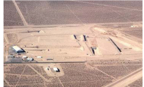
Radioactive Waste Management Complex