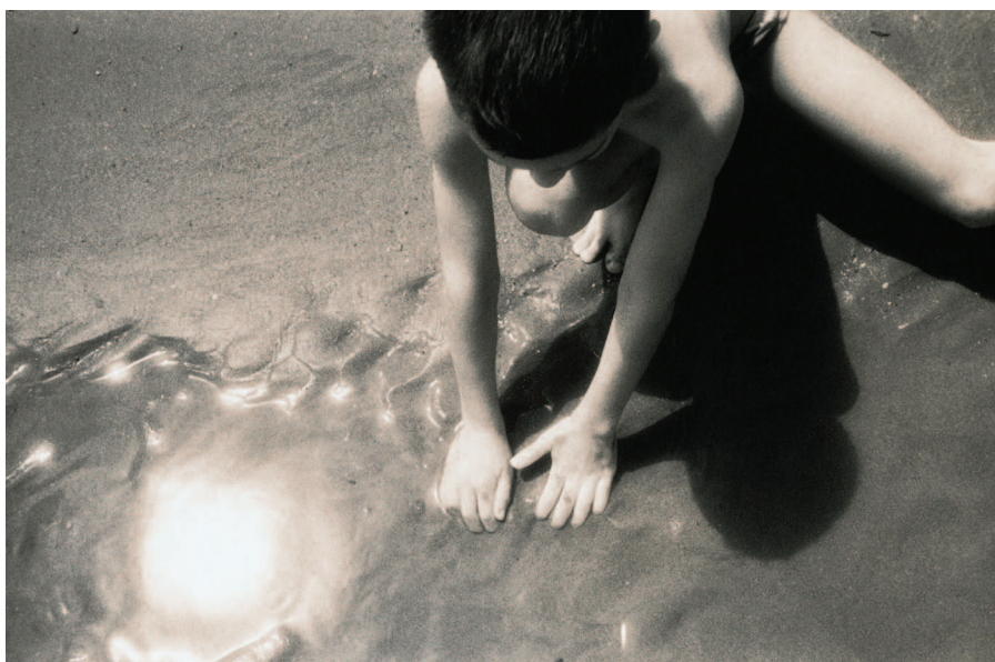
Ocean of possibilities. New research centers will investigate human health issues related to the ocean, such as conditions caused by marine toxins and the use of marine microorganisms to treat diseases.

One reason is a lack of programs that regularly test for the ciguatera toxins found in tropical reef fish. Another is the high cost of most existing testing programs for all types of HABs. “We need to develop low-cost, effective monitoring protocols affordable by poor populations in tropical and