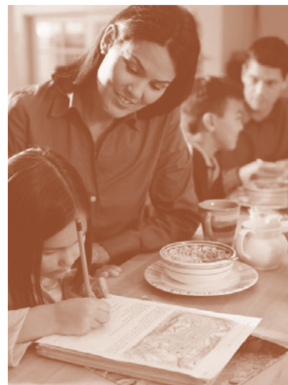
Environmental factors, such as a positive home life, may boost brain chemicals that offer resistance to drugs' reinforcing effects.

Collaborating With Other Federal Agencies. NIDA is participating in research initiatives with other NIH Institutes, including those that research allergy and infectious diseases, neurological disease and stroke, mental health, alcoholism and alcohol abuse, cancer, and child health and development. Studies funded under these initiatives will help the biomedical research and practice community better understand the links between addiction and comorbid mental and physical disorders. This research will accelerate discovery of prevention and treatment interventions for such disorders as hepatitis, HIV, mood and conduct disorders, and other problems often associated with drug abuse as cause, consequence, or both.