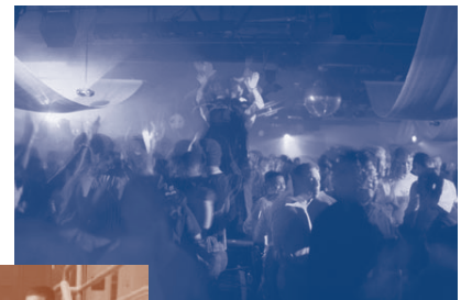
Annual student surveys track use of drugs like ecstasy, a popular dance party drug.

Policymakers and researchers rely on this information to assess the need for and effectiveness of community- and school-based drug prevention programs. To supplement CEWG and MTF data, NIDA has