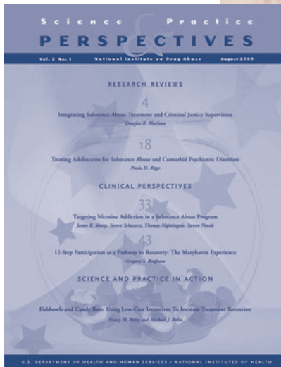
Fostering research-clinician partnerships is a focus of Science & Practice Perspectives, NIDA's peer-reviewed journal.