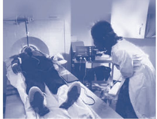
PET scans and other imaging techniques show how drugs affect brain activity.

NIDA is now opening new vistas in brain imaging drug abuse research. Studies assessing the ability of potential treatment medications and behavioral treatments to moderate the effects of abused drugs on the brain early in treatment and over the long term will accelerate development of new therapies. Other research examining how genetic