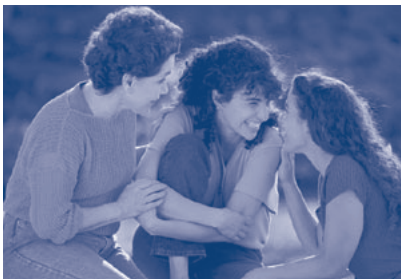
Family therapies tailored to the ethnicity or race of substance-abusing teens have proven successful.

In the last 10 years, behavioral treatments have demonstrated their potency in improving the health of diverse individuals with many types of drug abuse and other mental disorders. Proven treatments include individual cognitive-behavioral therapy, family therapies for Hispanic and African-American adolescent substance abusers, combination behavioral and medication therapies for adult smokers, and couples therapy for opiate-addicted men and women in methadone treatment programs. The benefits of many of these treatments endure long after treatment has ended. And with individual cognitive-behavioral therapy, the benefits appear to increase over time.