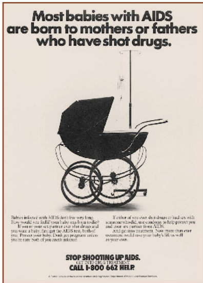
NIDA launched the “Stop Shooting Up AIDS” campaign in 1988 to warn IV drug users of HIV/AIDS risks.

built a program of ethnographic, cross-sectional, and long-term studies that provides continuous detailed information on patterns of drug use by gender, sexual orientation, race and ethnicity, age, and region.