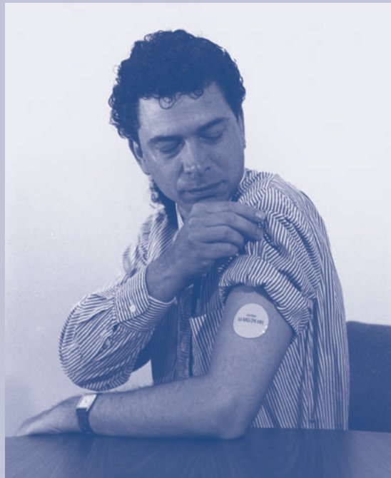
The transdermal patch, based on early NIDA research, has proven helpful to many smokers trying to overcome nicotine dependence.

Today, investigators at seven TTURCs across the country are carrying out the research agenda that gave birth to the centers. Their collaborations have produced scores of published studies that advance our understanding of nicotine’s addictive effects and the scope of influence smoking has on the Nation’s health. Consider the following research accomplishments and initiatives: