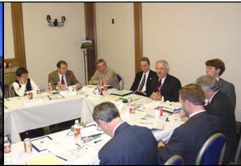
Southern Regional NEPA Roundtable discussion on the NEPA Task Force report entitled, Modernizing NEPA Implementation