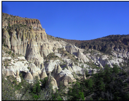
Tent Rocks, Jemez Mountains