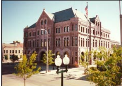
US District Courthouse, Sioux Falls, SD