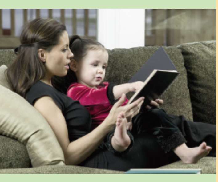
This information is intended to provide you with health information. It is not a substitute for consultation with a health professional.

CDC http://www.immunize.org/vis/ Information sheets produced by the CDC that explain the benefits and risks of a vaccine. VIS's are available in 28 languages and 14 diseases.