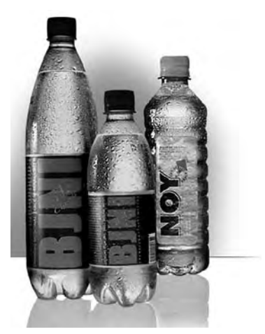
With Bjni and Noy off the shelves, the market share of other brands is growing

©2009 RFE/RL, Inc. Reprinted with the permission of Radio Free Europe/Radio Liberty, 1201 Connecticut Ave., N.W. Washington DC 20036. www.rferl.org