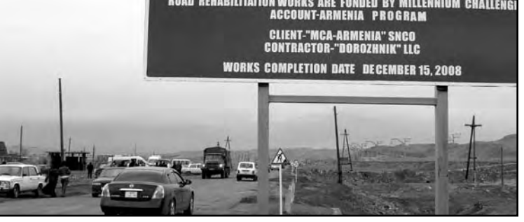
A segment of the Armavir-Isahakian-Gyumri road, completed Dec. 2008.