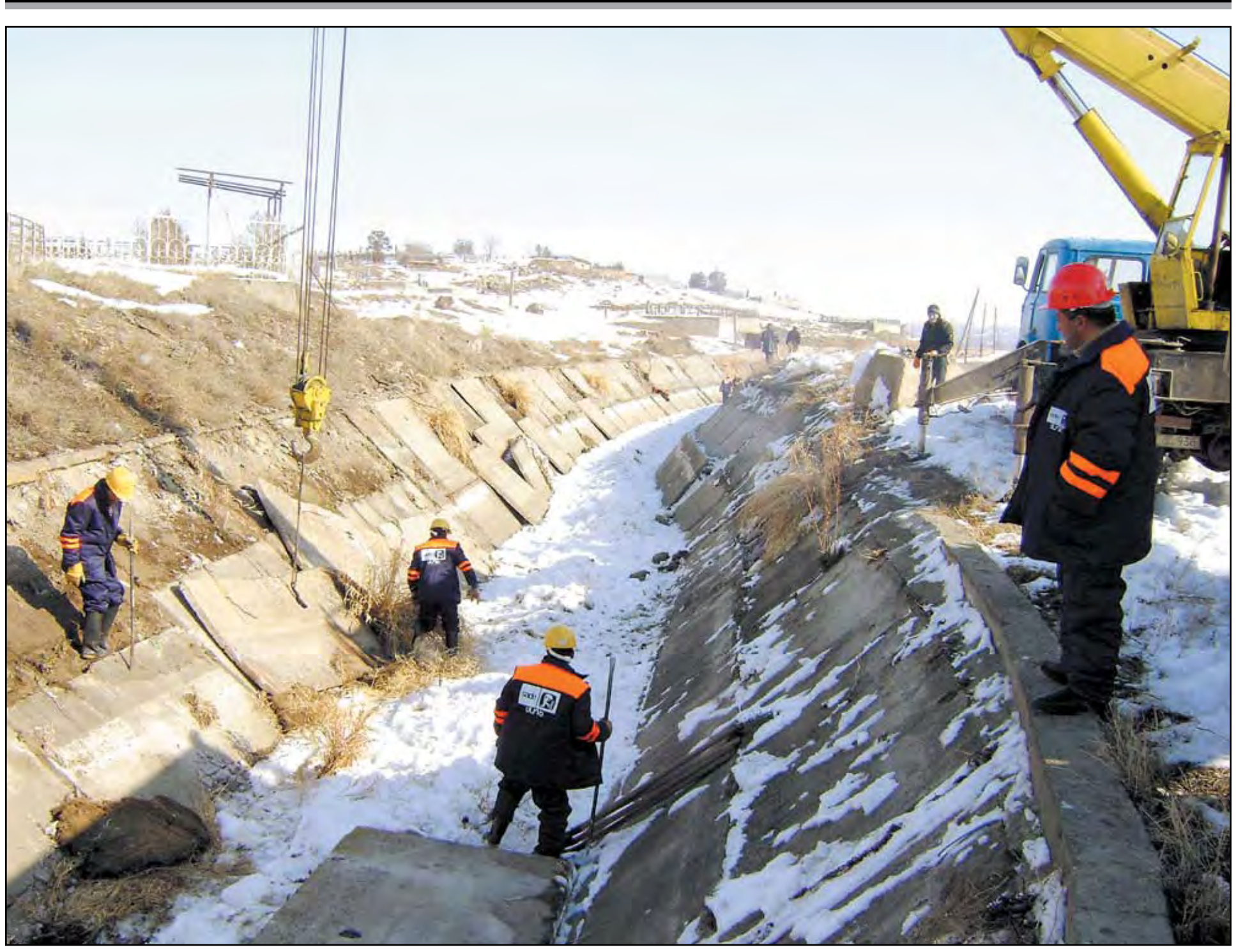
Construction on the Arzni-Shamiram waterway, Jan. 29, 2009.