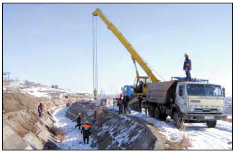
A construction crew renovates the badly damaged Arzni-Shamiram canal.

The U.S. Millennium Challenge Corporation's compact with Armenia is conditional on Armenia's continued eligibility in three major categories, one of which is demo-