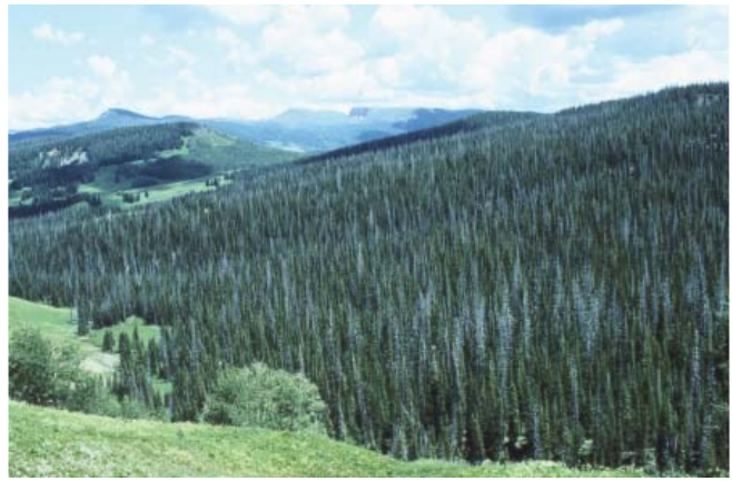
Dead trees from 1940s White River National Forest beetle outbreak are still visible.

The study showed that severe fires burn in this forest type during prolonged periods of heat and drought and it doesn’t matter much if the trees are living or dead. When drought is severe, the impacts of disturbances can be