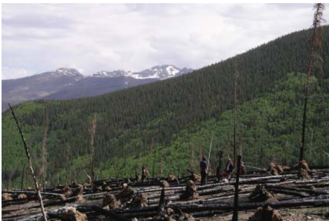
Remnants of the record setting 1997 Routt Divide Blowdown after the 2002 fire.

Outbreaks of spruce beetles are often triggered by blowdown or by logging that leaves slash on the ground. The Routt Divide Blowdown may have triggered the current spruce beetle outbreak. The millions of large dead spruce provided an unprecedented feast and an exceptional, protected habitat for the insects. Because the trees were piled on the ground, the insects were sheltered from wind and insulated from the cold by snow cover, so the population was able to survive the winter and continue expanding.