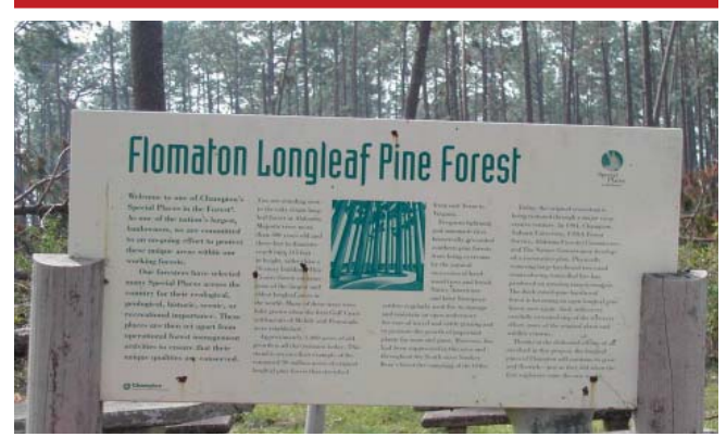
The Flomaton Natural Area served as a demonstration laboratory for visitors traveling through the area.