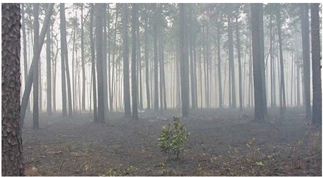
Flomaton Natural Area after a prescribed burn.

Though the Flomaton Natural Area was clear-cut in