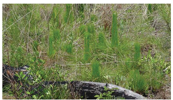
Longleaf pine in the grass stage.

"Pinchot described in detail the fire-adapted, thickbarked shoots of longleaf pine seedlings ('two-thirds bark and one-third wood') and the 'barrier of green needles' that 'itself burn only with difficulty' and which 'shades out the grass around the young stem, and so prepares a double fireresisting shield about the vitals of the young tree'," writes Rosiere.