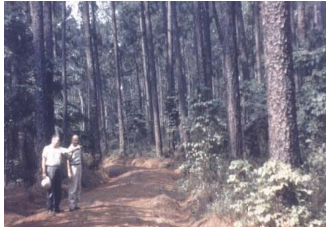
Photo taken in the mid-1950s. Note the heavily stocked stand with numerous large trees typical of old-growth longleaf pine forests.

for scientific and educational purposes. The managing partners included the Auburn University School of Forestry and Wildlife Sciences, the USDA Forest Service, and the landowner at the time, Champion International Corporation.