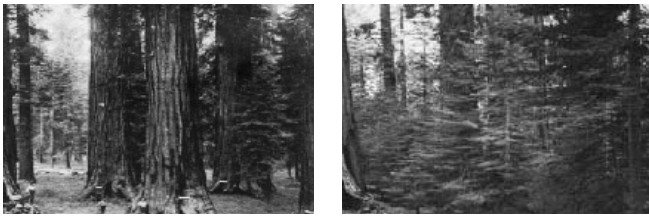
Photos showing an example of the same stand of mixed-conifer forest and giant sequoias in the Mariposa Grove, Yosemite National Park before (1890s) and after (1970s) fire exclusion.

Forest structure has shifted substantially from what it was a hundred years ago and many forests are now at high risk for stand-replacing wildfire. Forests have become choked with smaller, fire-prone species of trees that serve as “ladders” to the overstory canopy, increasing the risk of crown fires; they have large accumulations of litter than can burn hot and easily kill older, otherwise healthy trees; and the smaller, fire-prone trees are typically not of much financial value.