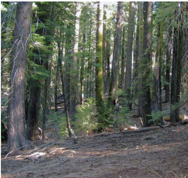
Fire-excluded stand at Teakettle.

Another intriguing result relates to water. Researchers found that water is the primary influence on ecosystem function in mixed-conifer forests. This included tree regeneration, nutrient cycling, decomposition, and understory diversity. Water in the Sierra Nevada is scarce during the summer months, and forests rely on the previous winter's snow to provide almost all of the soil moisture. In fire-excluded stands, with many small trees competing for limited soil moisture, water was usually the limiting factor for many ecological processes. Thinning significantly reduced the number of small trees increasing water availability. However the forest only benefited from this increase in water if fire was applied to remove slash and thick litter layers which otherwise slow recovery.