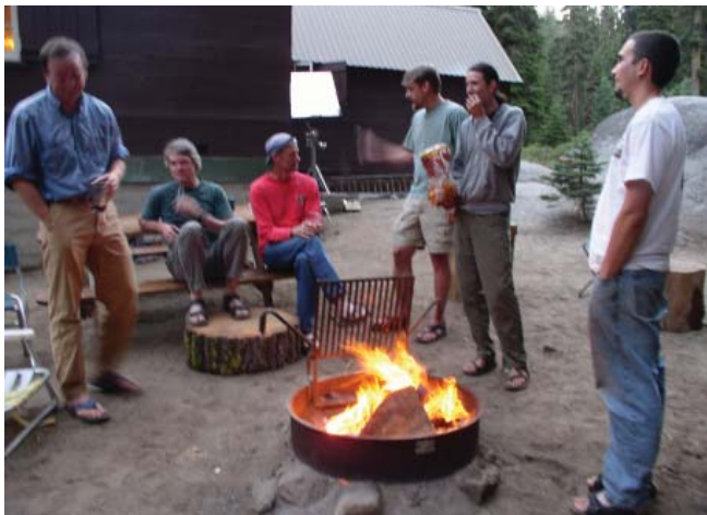
Scientists enjoying the collaboration and inquiry common to their research interests at Teakettle.

Working together, Teakettles' researchers examined everything from nutrient cycling, to invertebrates, to plants, to nitrogen, to soil respiration, to decomposition and more. The intense focus in one place and coordinated sampling provides a more complete understanding of how fire and thinning fuels treatments, affect a complex web of processes within a forest. Although working at just one location, the combined insights from Teakettle may be widely applicable in other forests.