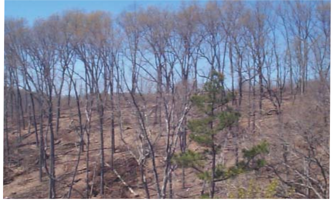
Thinning operations reduced site stocking by an average of 59.1 percent.

Overstory Thinning Results —All study plots were fully stocked stands dominated by oak and hickory species. Pretreatment tree density ranged from 241.6 to 485.5 trees/ acre, with a mean of 357.4 trees/acre. Pretreatment basal area ranged from 79.5 to 146.2 ft<sup>2</sup>/acre (7.4 to 13.7m<sup>2</sup>/ha). The thinning operation removed on average 101.8 trees/ acre and 57.7 ft<sup>2</sup>/acre. Thinning treatments reduced stand stocking by an average of 59.1 percent.