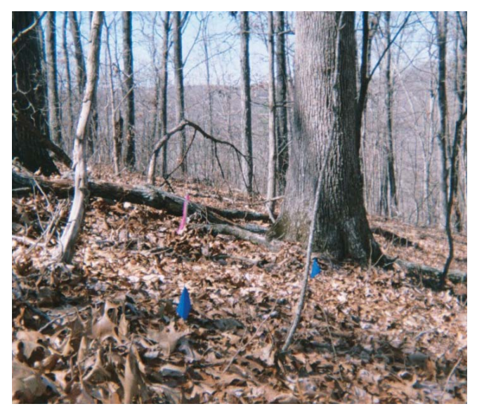
Project included extensive evaluation of the effects of slope and exposure on fuel levels and burn intensity.

The research area is in the central Ozarks region in southeastern Missouri. Steeply rolling terrain has typical slopes of 10 to 35%. The region is about 85% wooded. Elevations range from 600 to 1,000 feet.