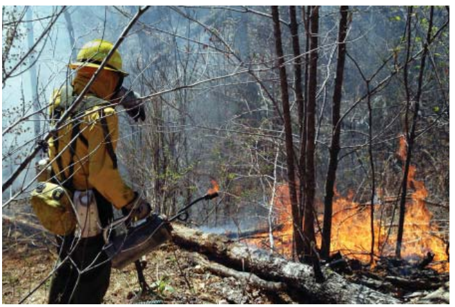
Because of overstory clearing, there was more 1000 hour fuel at ground level in the thin-and-burn category sites.

According to Kabrick, there was little significant difference in average fuel consumption between thin-andburn and burn-only areas in the three aspect categories, with the exception of greater solid 1000-hr fuel consumption in the thin-and-burn category in all three aspect classes. Because of overstory clearing, there was much more 1000-hr fuel at and near ground level in the thin-and-burn category.