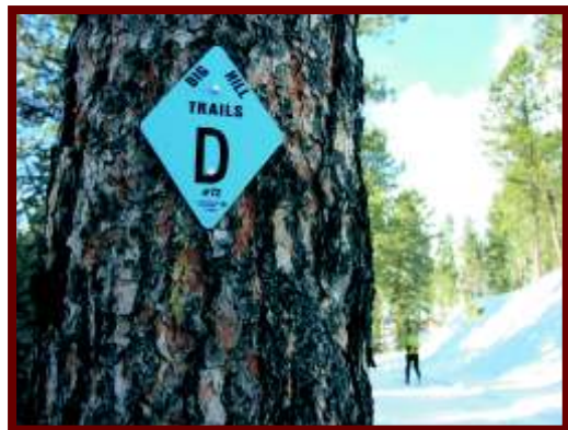
Trails are marked with blue diamonds.

Location: From Spearfish take FSR 134 south approximately eight miles to the trailhead.