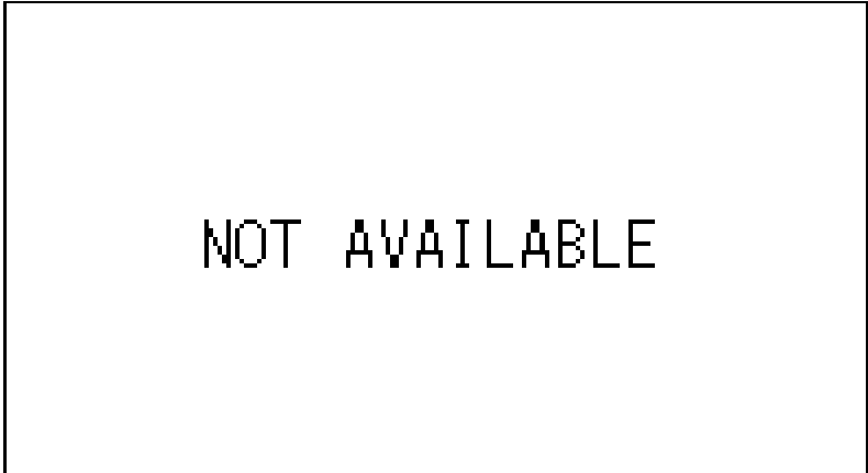
Figure 2: Multiple views of streamlines over a delta wing.