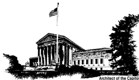
Architect of the Capitol

The Supreme Court is open to the public from 9 a.m. to 4:30 p.m., Monday through Friday. Congressional reservations for lectures can be obtained for these days for tours at 1:45 p.m. by calling my office at least one month in advance for groups of six or less . If your group is larger or you do not want to make a reservation, public lectures begin at 9:30 a.m. and run one per hour on the half hour until 3:30 p.m. when the court is not in session.