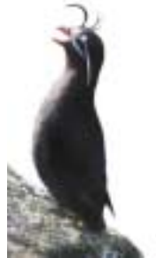
Whiskered Auklet, a rare alcid found in the Aleutians.

There's nothing like identifying the Bristle-Thighed Curlew at 2 a.m. Or spotting the shy but always stylish Whiskered Auklet for the first time. And there's no airline that covers the last frontier like Alaska Airlines. We fly to 20 cities throughout the state, with nonstops from the West Coast and Chicago, and easy connections from six East Coast points. All of which mean the 49th State is closer than you think. Just don't forget your life list. So start your Alaska adventure at alaskaair.com or call 1-800-252-7522. For information on the State of Alaska's birding certificate program, "Wings over Alaska," visit www.birding.alaska.gov .