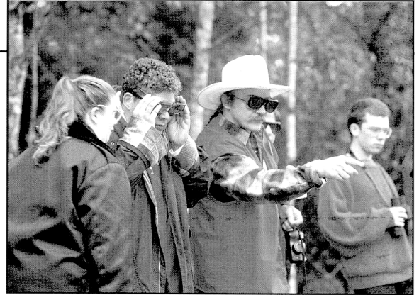
Mentor and students study spawning salmon.

Key Partners: Oregon Trout, Portland General Electric.