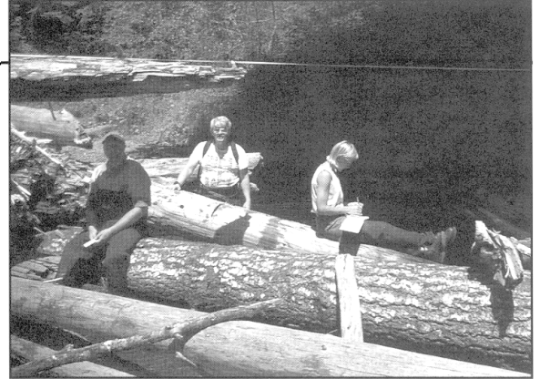
Teachers monitor aquatic habitat on Clear Fork of the Sandy River.

Key Partners: Portland State University, National Science Foundation, and WolfTree, Inc.