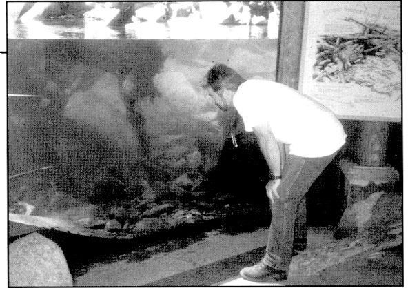
Underwater viewing window.

Key Partners: Bureau of Land Management, Wolfree, Inc., Portland area schools, Portland General Electric, Portland Water Bureau.