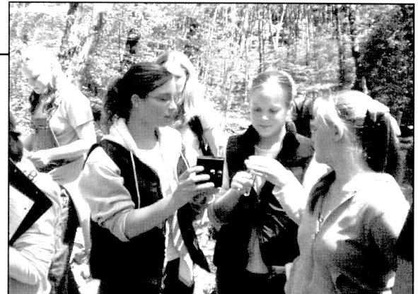
Students analyze water quality conditions.

Key Partners: Naches Middle and High Schools, Washington Elder Hostels