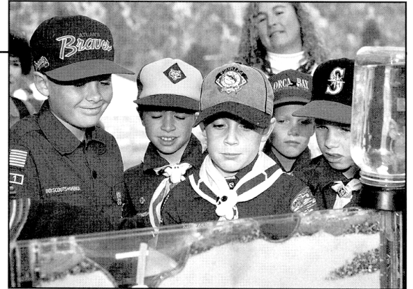
Scouts check water quality in their hometown watershed.

Key Partners: Lake Roosevelt National Recreation Area, Avista Utilities, Cominco of Canada, and Washington Department of Fish and Wildlife.