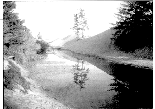
Unique watershed conditions near festival site

Key Partners: Confederated Tribes of Coos, Lower Umpqua, and Siuslaw Indians Reedsport/Winchester Bay Chamber of Commerce City of Reedsport-Umpqua Discovery Center, Reedsport School District, Bureau of Land Management