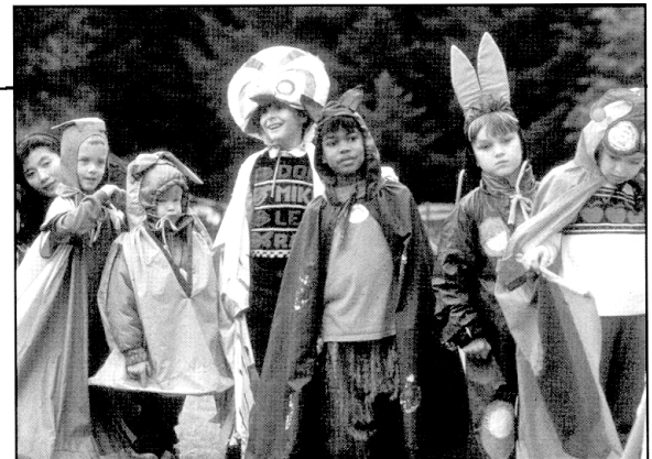
Web of Life Parade: kids transform into forest creatures.

Key Partners: US Fish and Wildlife Service; Leavenworth, Washington Chamber of Commerce, Confederated Tribes of the Colville and Yakima Indian Nations, Bonneville Power Administration.