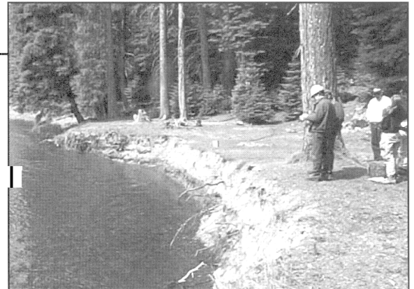
Campers help plan streambank restoration.

Key Partners: Northwest Interpretive Association, Nature Conservancy, R.E.I