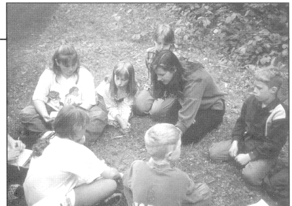
Children study soils in unique forest ecosystem in SW Oregon.

Key Partners: Oregon Department of Fish and Wildlife, US Army Corps of Engineers, Bureau of Land Management.