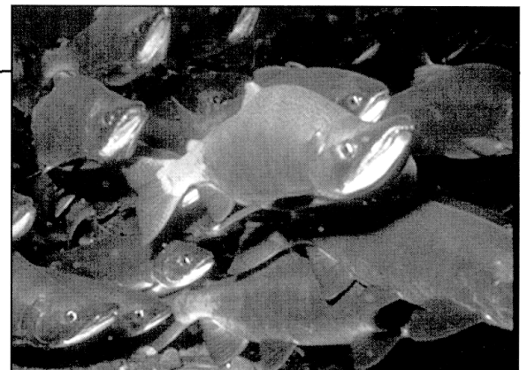
Returning sockeye salmon

Key Partners: North Cascades Institute and the National Park Service.