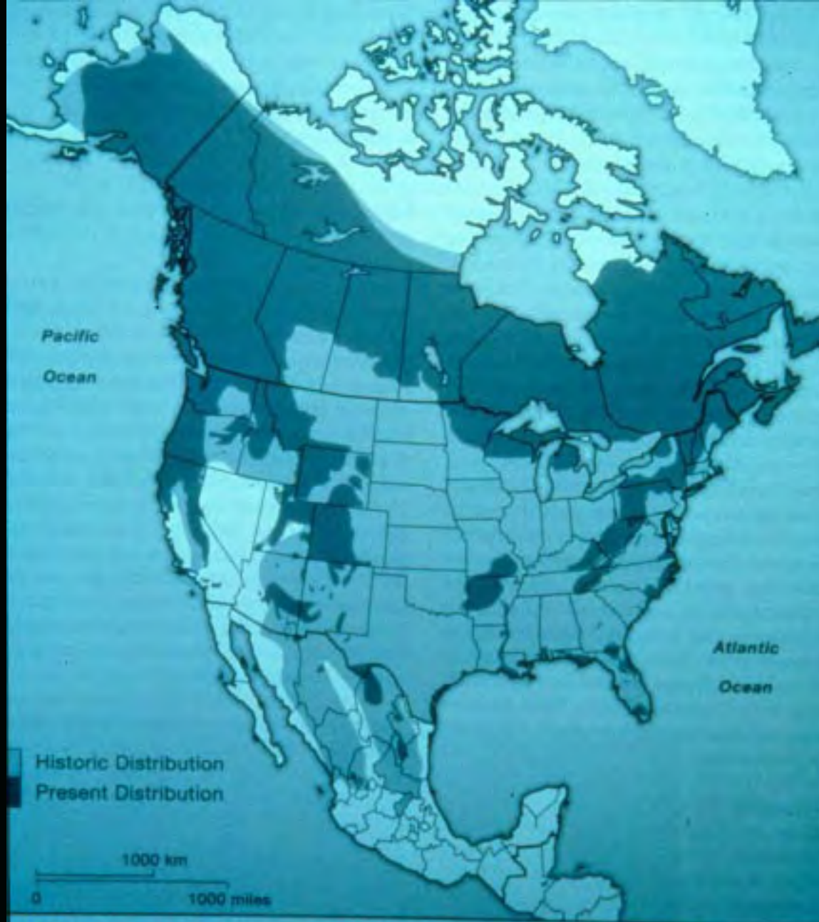
Figure 1. Historic and present distribution of black bears ( Ursus americanus ) in North America.

Responses from 35 states, black bear populations are increasing with the exception of Idaho and Colorado. The total population estimate of black bears in the United States is between 186,881 and 206,751. This does not include data from Alaska, Idaho, South