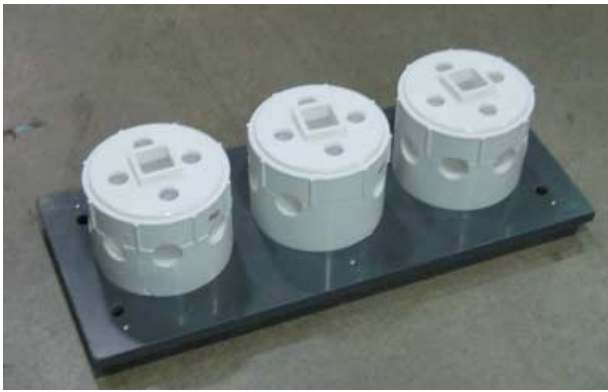
Figure 1 Three emergence traps bolted to PVC platform. Holes in lids and sides of traps are covered with 53 \mu\text{m} Nitex plankton mesh. Holes at platform corners were used to secure traps to ballast tank's internal structure.

diameter) pipe cap with a threaded lid, having a surface area of approximately 180 cm 2 . Bolts were put through the bottom of the pipe cap to secure the trap to a rectangular PVC platform and sealed with silicone glue (Fig. 1). Twelve holes of approximately 2.5–4 cm diameter were drilled through the lid and wall of each trap, and were subsequently covered with Nitex plankton mesh (mesh sizes given in succeeding discussion). Mesh was attached to the interior surface of the trap housing using clear PVC cement and edges were sealed with silicone glue. After construction, traps were left to cure for 48 h and were subsequently rinsed with deionized water to remove any coarse debris and soluble compounds left by the glues.