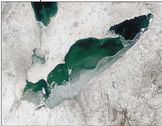
Figure 1. Moderate Resolution Imaging Spectroradiometer (NASA) satellite image of Lake Erie for March 12, 1999. The lake is approximately 50% ice covered; note that the north portion of the lake is open water.

Winter ice formation and seasonal ice cycles have been documented over the past 43 winters through visual observation, radar, and satellites (Figure 1).