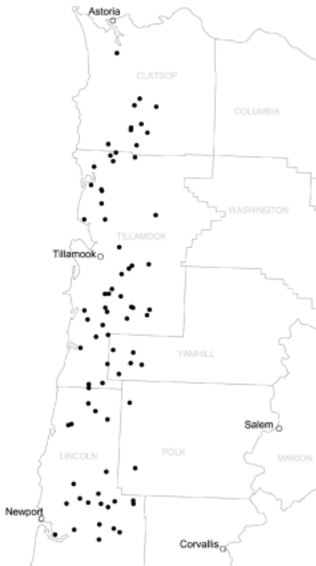
Figure 1. Locations of sample plantations included in the Swiss needle cast growth impact study.

tree, with 0 representing no discoloration and 3 representing the most severe discoloration. Slope, aspect, elevation, and other site information were also compiled for all plantations.