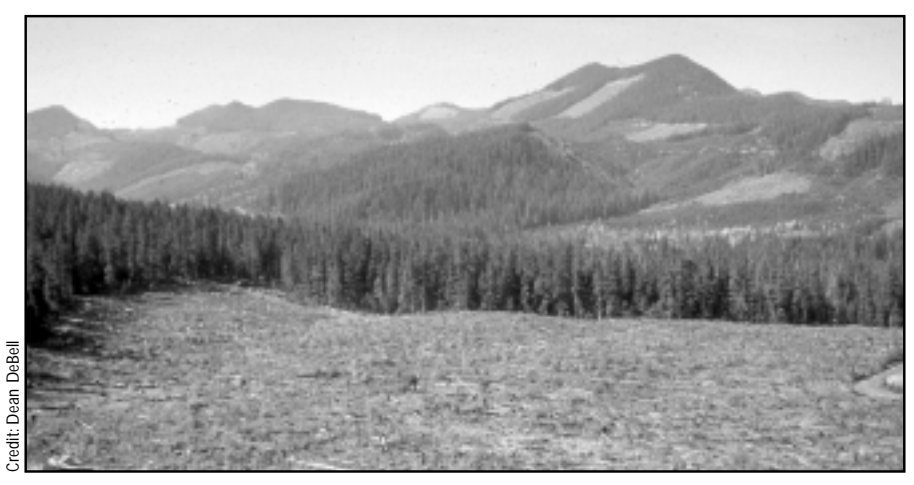
Clearcuts in full view of well-traveled highways or located close to residential areas frequently bring conflict and complaint or litigation to forest owners regardless of how carefully planned and executed.

"Of all the non-timber values, forest aesthetics is the most visible, and when ignored, can cause the most negative reaction."