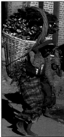
A Fuelwood gathering is a universal sight in developing countries. Efforts to reduce consumption by designing more efficient cooking stoves has produced more than 900 designs.

T he simplest of statistics suggest we have a problem. In the last four decades, global consumption of wood—both industrial roundwood and fuelwood—has hovered around 0.6 cubic meters per person. But in the same four decades, the number of consumers in the world has doubled.