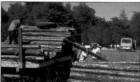
A In Chile, false beech is heavily harvested for domestic and international markets. Plantation farming will take some of the pressure off this native species.

"Then there's the plantation-based forest industries such as you find in Chile and New Zealand with radiata pine," Brooks notes, "and this is also happening in different ways in tropical countries. In Brazil you now see steel mills fueled by charcoal produced locally from fast-growing plantations, expanding the term 'industrial wood' to mean wood for industrial energy." Likewise, there is a strong trend in many countries toward short-rotation crops, such