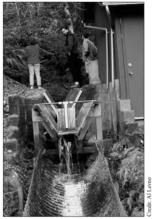
Gauging stations in very small watersheds allow scientists to track streamflow processes through time in a tightly controlled datacapture environment.

As forest management attention has shifted to revegetation, the effects of thinning, and forest health and watershed recovery issues, the small watersheds have continued to yield streams of long-term information to feed