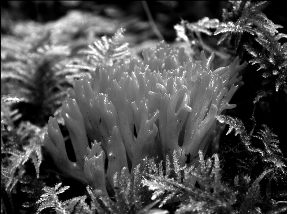
Red coral fungus.

Second, the annual review process found a sizable number of species to be more common than thought and removed them from the list. Some of these changes were highly significant from a management perspective. Molina gives the example of delisting the Del Norte salamander and the bluegray tail- dropper mollusk, which released approximately 2,000 matrix-land sites for other management activities. In addition, the placement of some species into a category where preproject surveys were no longer practical or needed also notably reduced the level of these expensive surveys.