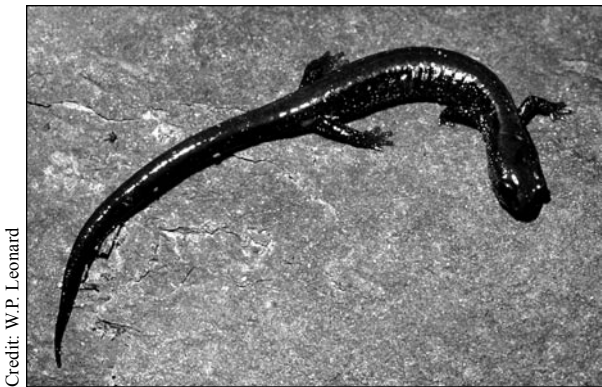
Del Norte salamander.

As teams of agency specialists drafted the final environmental impact statement (EIS) with this and other objectives in mind, a number of mitigation challenges became evident. First, many species of concern were rare or locally endemic, and the sites where they occurred did not overlap with an area