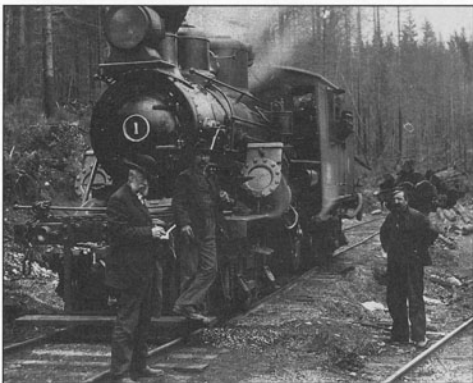
A Railroads opened up the basin to settlement by pioneers attracted by new economic opportunities, particularly in resource-extractive industries. They have been an integral part of historic boom-or-bust cycles throughout the basin.