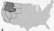
A The 145-million-acre area of the Interior Columbia Basin Ecosystem Management Project encompasses parts of seven states, and 72 million acres of public land managed by the Forest Service and BLM.

Not one of the 400 or so small rural communities (population less than 10,000) lying within the 145 million acres of the Interior Columbia Basin Ecosystem Management Project area has avoided the incon-