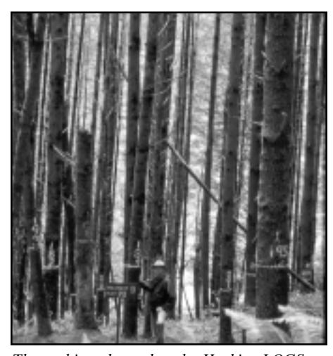
The unthinned stand at the Hoskins LOGS installation at age 50. The stand has developed to a high density with many smaller trees and no plants growing in the understory because of a lack of light reaching the ground.

ontrary to some views held in the past, thinning in uniform-aged Douglas-fir forests will not markedly increase total volume production. That is, not unless rotations are extended well beyond 50 years. Thinning