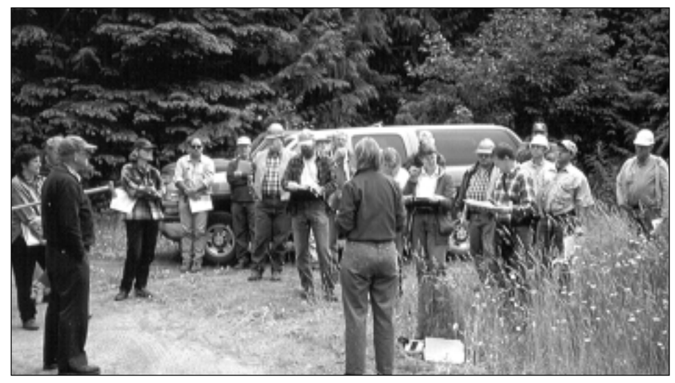
Field trips are an effective way to communicate the affects of thinning on stand development to people from a wide range of natural resource disciplines and interests.

It was perhaps not contemplated in the early days of the LOGS study design that some of its greatest value would lie in its visual aspect.