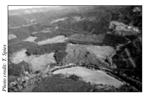
Coast Range landscape showing pattern of agriculture in valleys and intensive forest management in steep uplands.