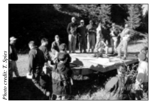
A CLAMS researchers meet with managers from Willamette Industries during a CLAMS field trip in the Oregon Coast Range. Scientists have sought cooperation with industry in verifying vegetation and other data.