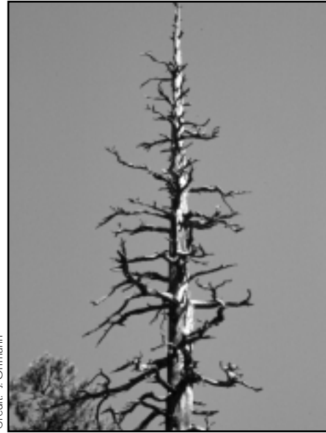
Ponderosa pine snags in central Oregon provide valuable wildlife habitat.

Direct comparisons with published estimates are challenging because of differences in geographic location, vegetation types, and disturbance histories among studies sampled. "Also, because our estimates describe average conditions integrated across a wide range of sites and disturbance histories, it is problematic to compare our numbers to studies conducted at local sites," Waddell adds.