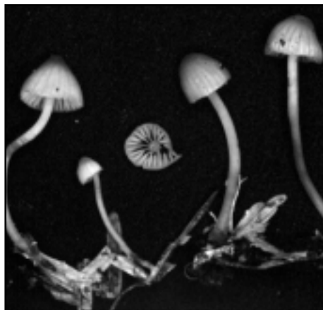
The forests of the Pacific Northwest are well known for their rich diversity of macrofungi, such as these mycena. Issues relating to conservation and management of forest fungi in the Pacific Northwest must be placed in the context of public land resources and federal laws regulating forest management.