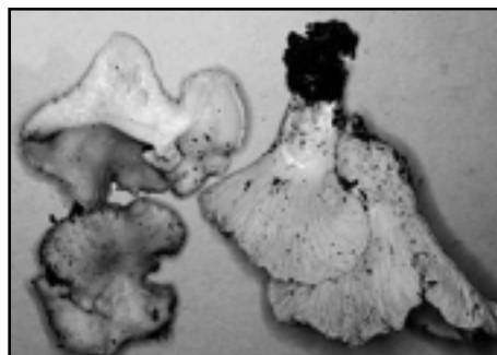
Over 230 species of rare, old-growth forest dependent species, including chanterelles, were originally listed for protection under a federally mandated regional forest conservation program.

The Northwest Forest Plan is designed to be a new generation forest plan: it looks at the whole forest ecosystem, with the intent of protecting not just a few species such as the spotted owl and the salmon, but all forest creatures great and small. A contentious element of the plan is the "survey and manage" requirement: certain rare species must be surveyed individually prior to ground-disturbing activities so that their location can be considered and protected in the project design.